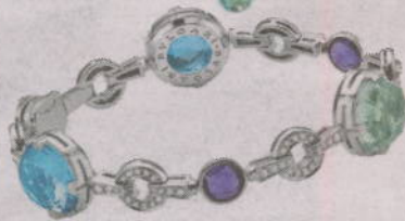
Bulgari White gold bracelet with blue topaz, green quartz, amethyst and pavé diamonds $17,850