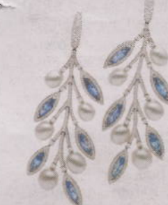
Paspaley south sea pearl Marquise earrings with tanzanite and pave-set diamonds in platinum $38,800

Keep it real Stocks are shot, housing prices are down – so invest in something you'll get joy from. Diamonds, rubies, sapphires, tanzanites, pearls and aquamarines – not faux – are a girl's best friend