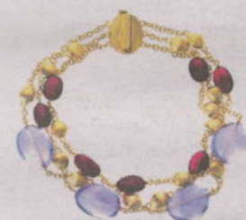
Marco Bicego Confettie Gemme bracelet $3950 from McKinney's