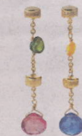
Marco Bicego 18ct yellow gold, briolette gem drop earrings $495 from McKinney's