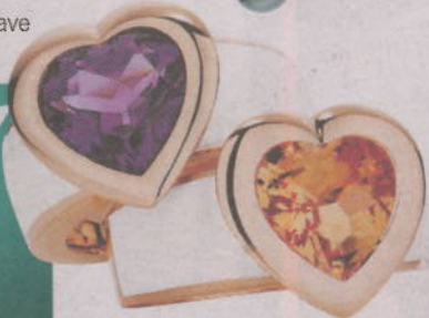
Calleija Jewellers heart-shaped morganite ring $5900, amethyst heart-shaped ring $4500