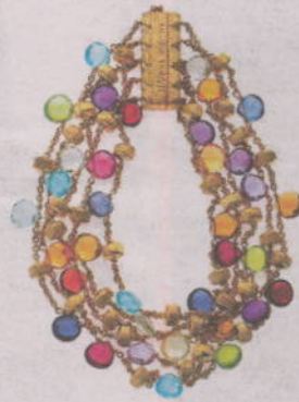
Marco Bicego 18ct yellow gold five-row multi-briolette gem bracelet $4500 from McKinney's

Stockists Tiffany & Co., QueensPlaza, City, au.tiffany.com; Calleija Jewellers, calleija.com; Bulgari Brisbane, David Jones, Queens Plaza, Queen St, 3243 9316 and bulgari.com; Paspaley, 1300 888 080; McKims, Savoir Faire, Park Rd, Milton, 3368 3377, mckims.com.au; McKinney's Jewellers, Emporium, 3257 2222, mckinneys.com.au